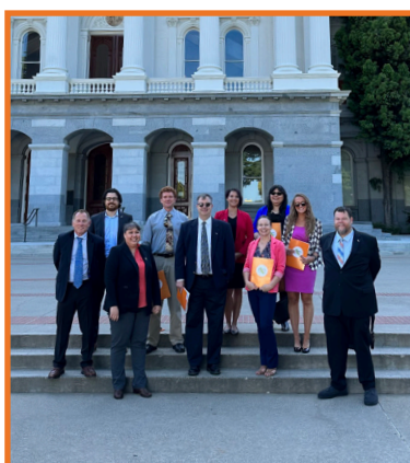
The CAPS group assembles on the Capitol's West Steps.